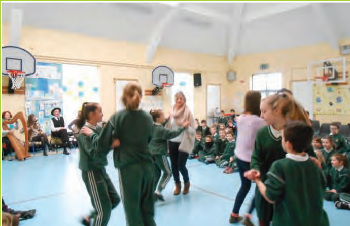
Need Caption here