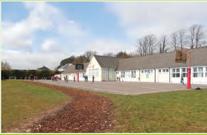
Our new running track