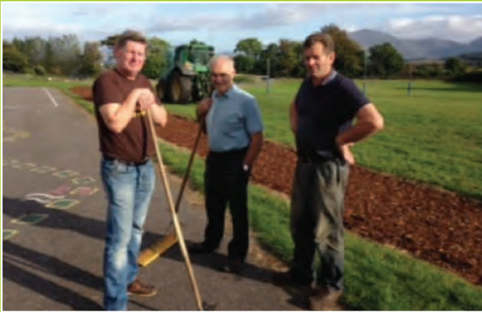
Gardening pic 1