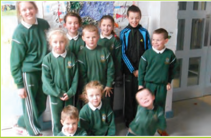
Green School Committee