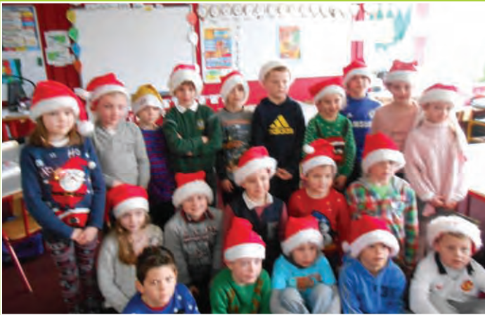
Senior Infants & 1st Class