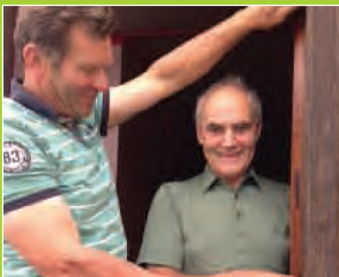
Bye to the Prefab