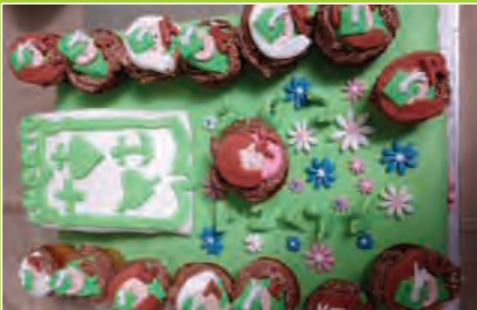
Need Caption here