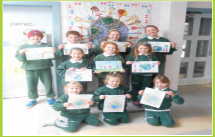
Green School Competition winners