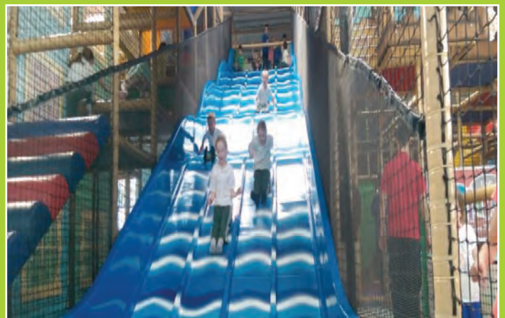
Junior, Senior Infants & First Class School Tour