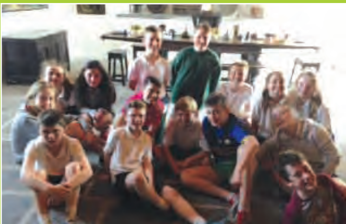
Need Caption here