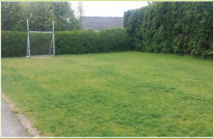
New all weather pitch