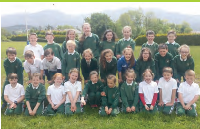
School Relay Teams 2015