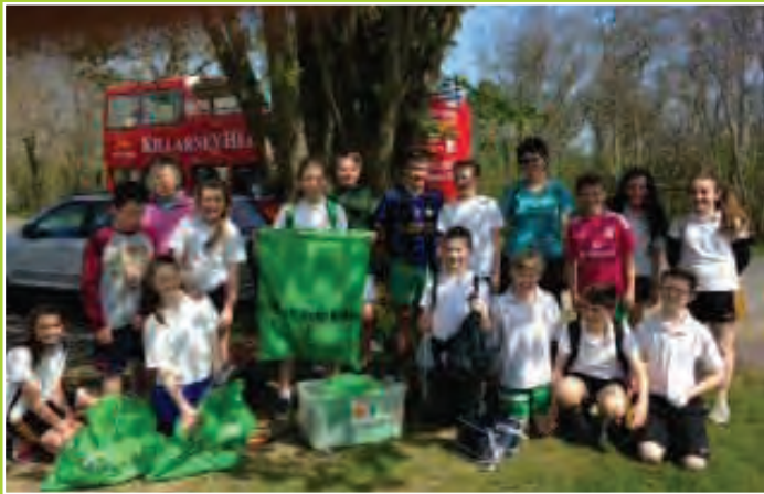
National Spring Clean