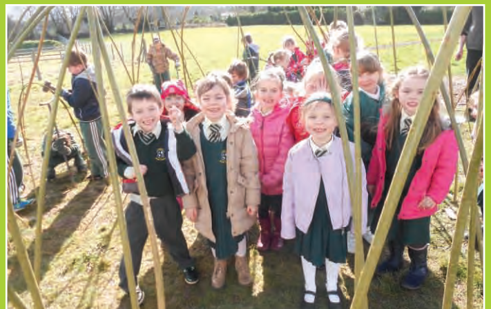
Need Caption here