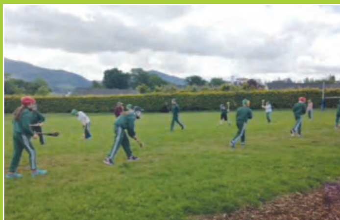
Hurling with Pat