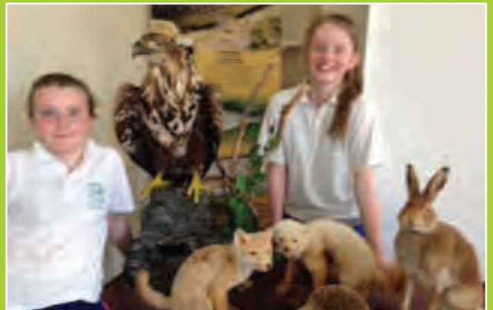
Need Caption here