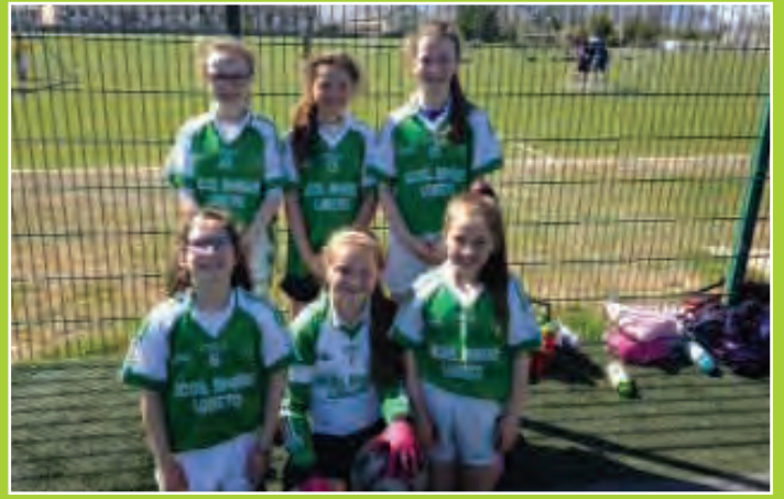
Girls Soccer Team