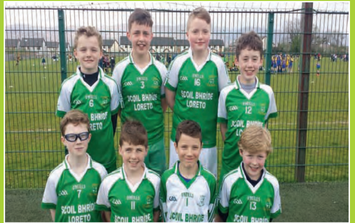
Boys Soccer Teams who qualified for the county semi final