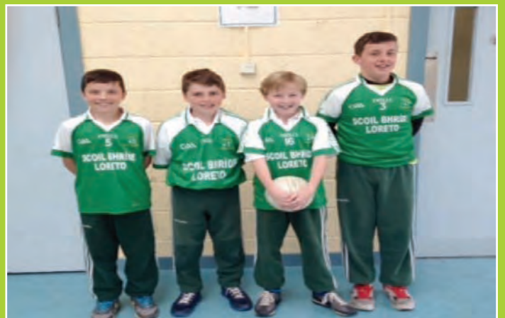
Girls and Boys Football skills team