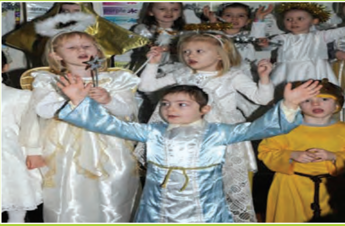
Junior & Senior Infants