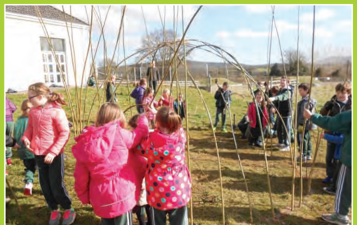
Making the willow tunnel