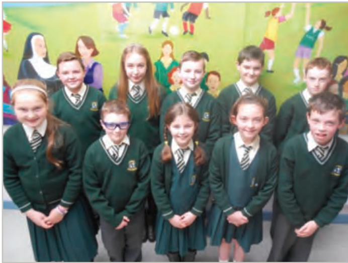
Student Council members