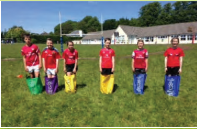
Need Caption here