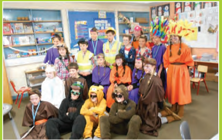
5th & 6th Class