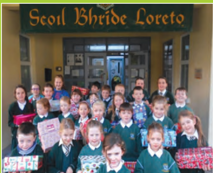
Christmas Shoebox Appeal