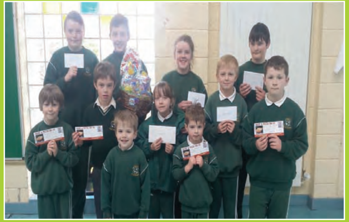
Easter Raffle Winners