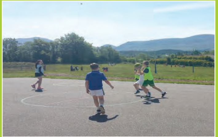
School Sports Day 9th June 2015