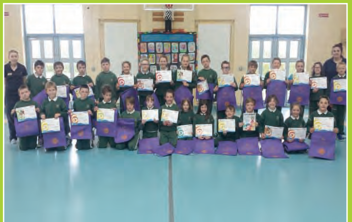
4th Class Swimming