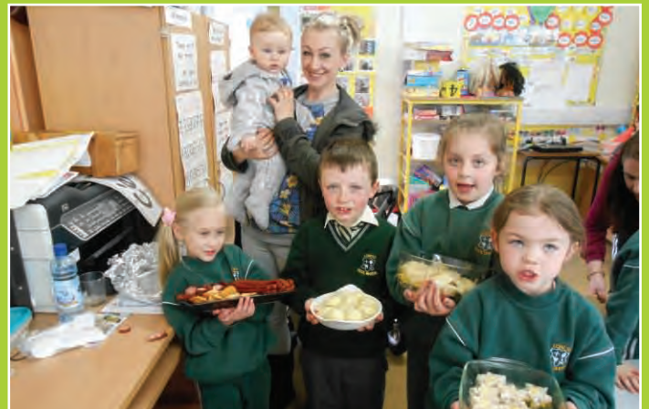
Celebrating Polska Festival