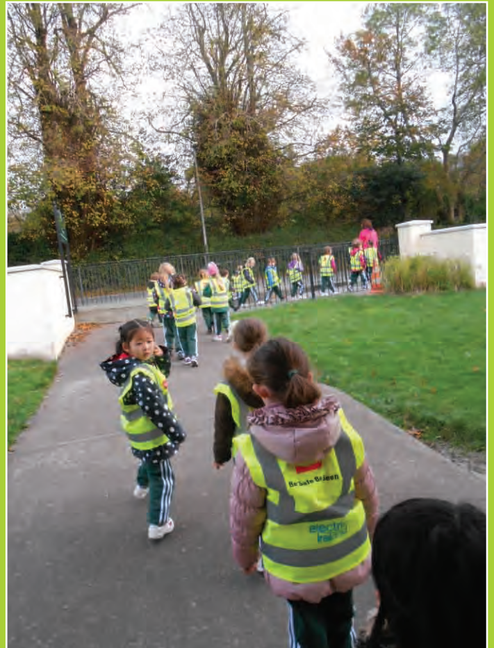
Need Caption here