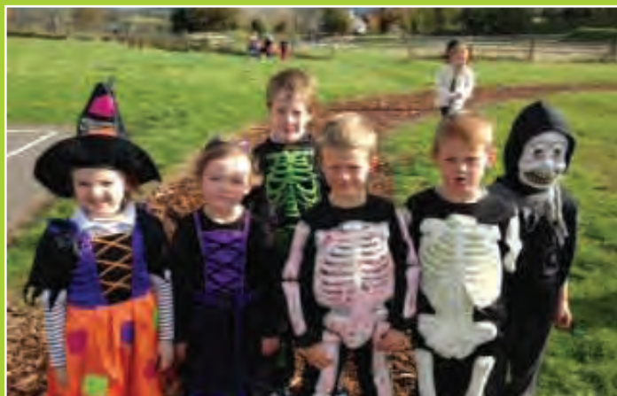
Halloween Fancy Dress