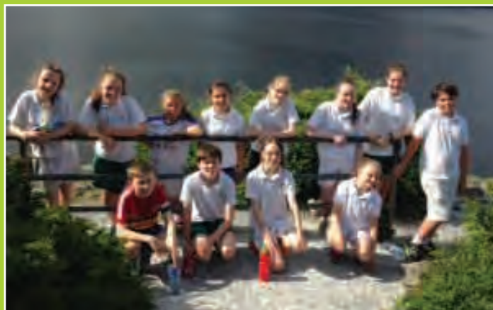
Couch Potato to 5K