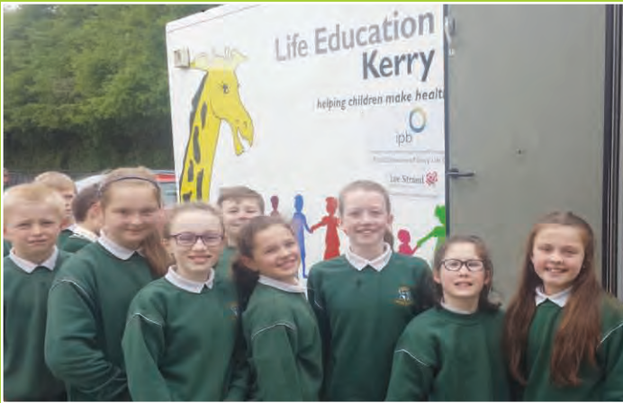
Life Education Bus