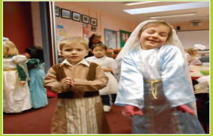
Junior & Senior Infants