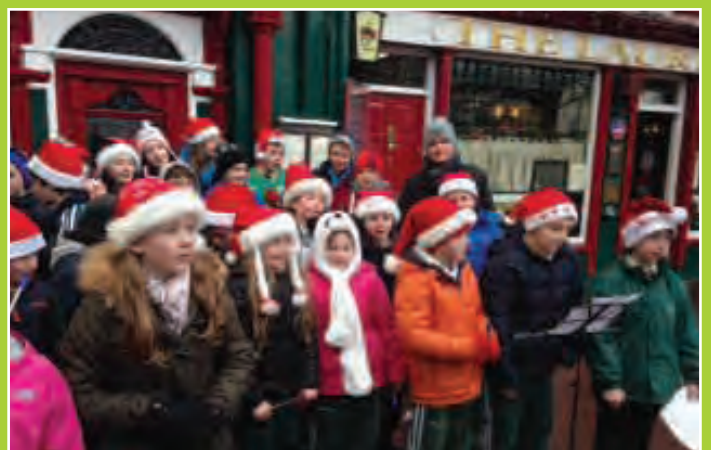
Carol Singing & Flag Day