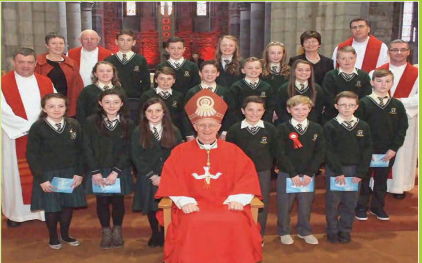
Confirmation Class 2015