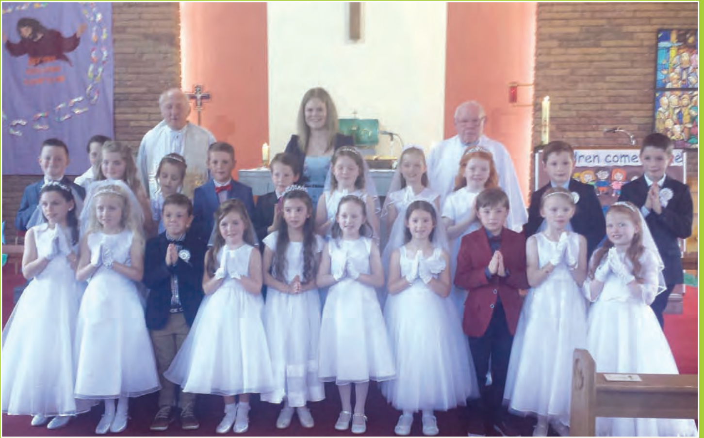
First Holy Communion Class 2015