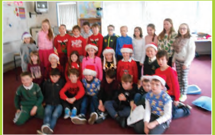
3rd & 4th Class